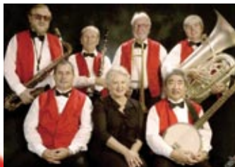
Swingin' Tradewinds Jazz Band