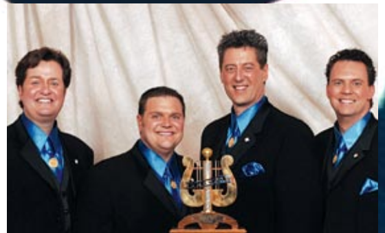
MAX Q The Barbershop Harmony Society's International Quartet Champions!