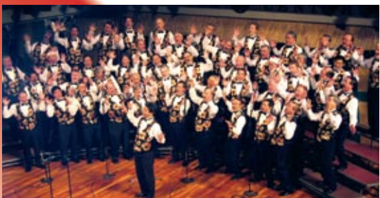
The Sounds of Aloha Chorus Hawaii's premiere men's Barbershop Chorus